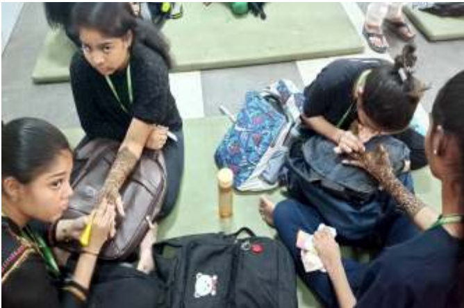
(Face Painting and Mehendi Competition)