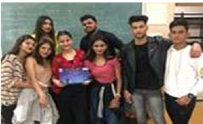
(Fashion show team)

Our junior college students participate in various Intercollegiate events across Mumbai and bring laurels to the college.