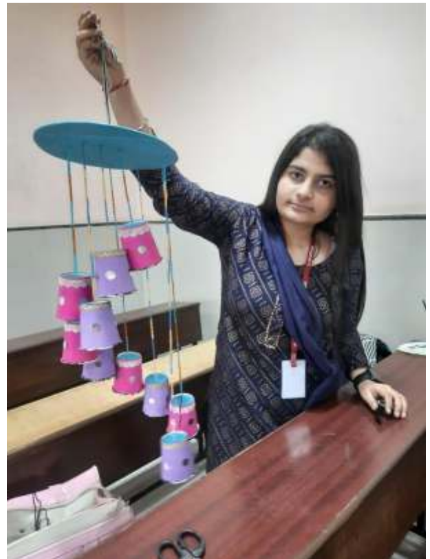
(Best out of waste)

“ Work hard, dream big, never give up. ”